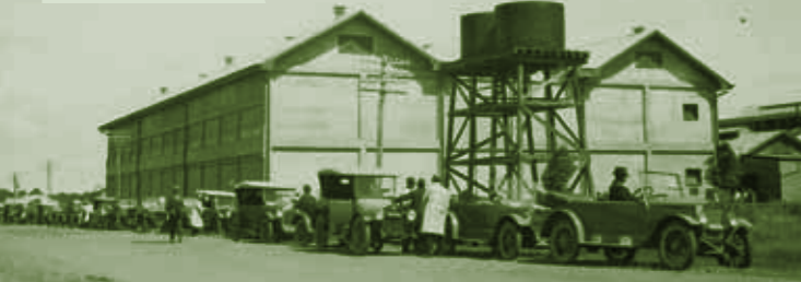
Freezer Works c1930