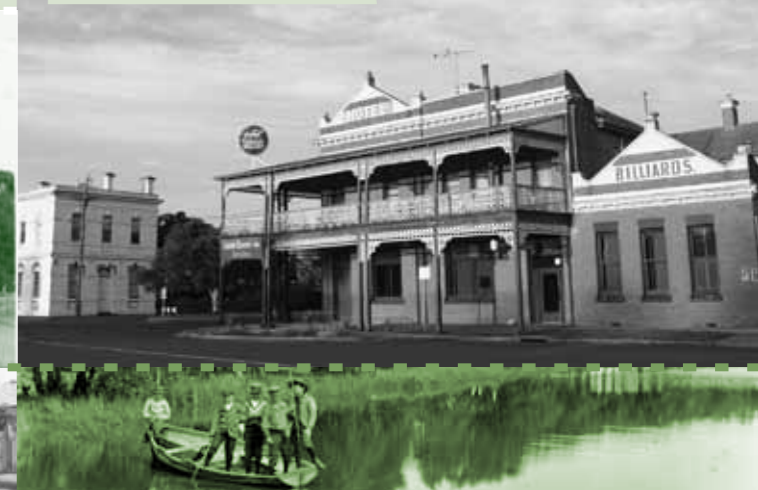
Marma Gully Hotel & Commercial Bank Building as seen today