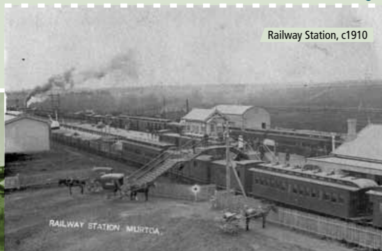
Railway Station, c1910