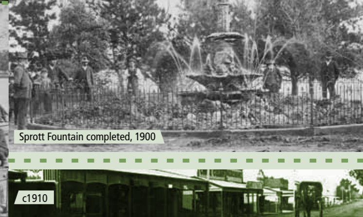
Sprott Fountain completed, 1900