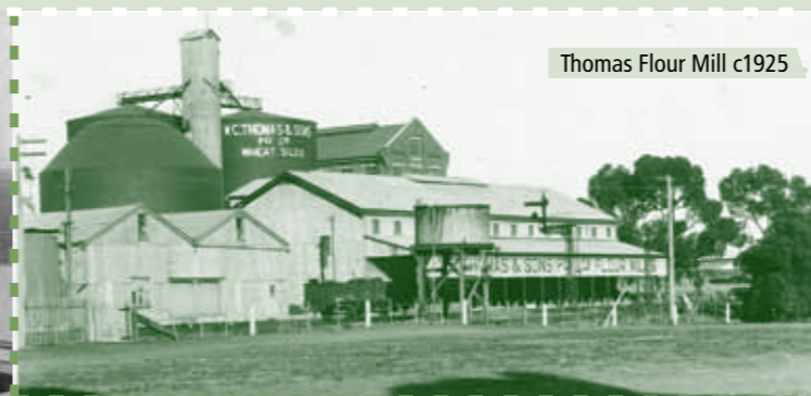
Thomas Flour Mill c1925