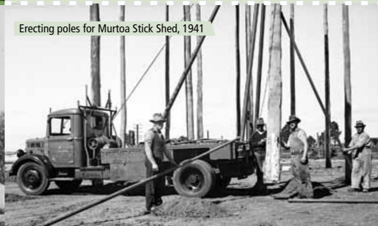
Erecting poles for Murtoa Stick Shed, 1941

Join us on the Wimmera Mallee Tourism & Yarriambiack Tourism Facebook Pages