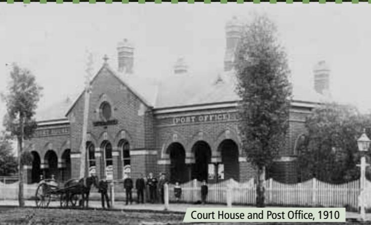
Court House and Post Office, 1910

Murtoa Stick Shed and Dunmunkle Sumpoiler's Historic Engines Open at Murtoa's Big Weekend First Weekend in October